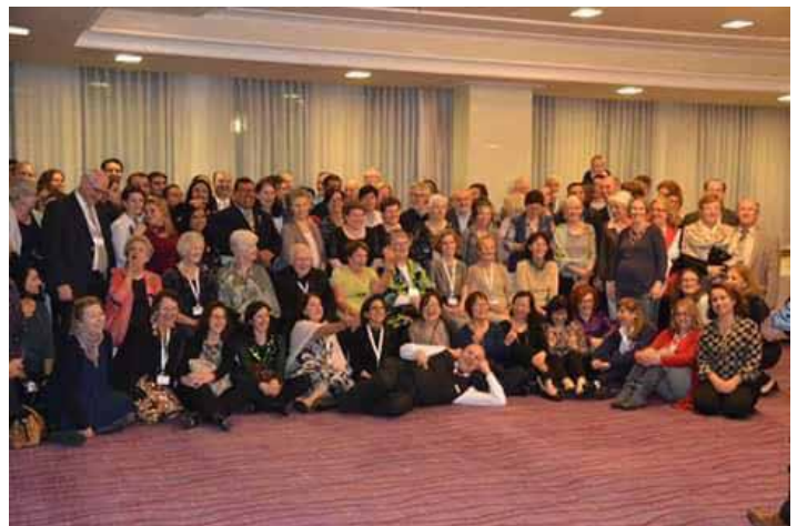
Group photo taken at conclusion of Conference Dinner

This issue of the Bulletin of WOOMB International will publish the ethical and philosophical papers from the Conference. Vol 43 No 3 in November 2016 will publish medical and scientific papers from the Conference.